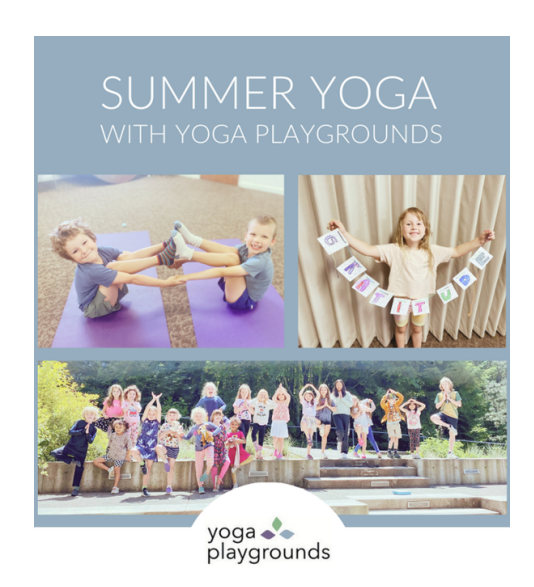
PreK-5<sup>th</sup> grade | June – July Packed with playfulness, positivity and fun!

Yoga Playgrounds is back on Tuesdays at Chief Joseph Elementary School 2:30-3:30pm Grades K-5 April 8 - June 3 / 9 classes Register HERE